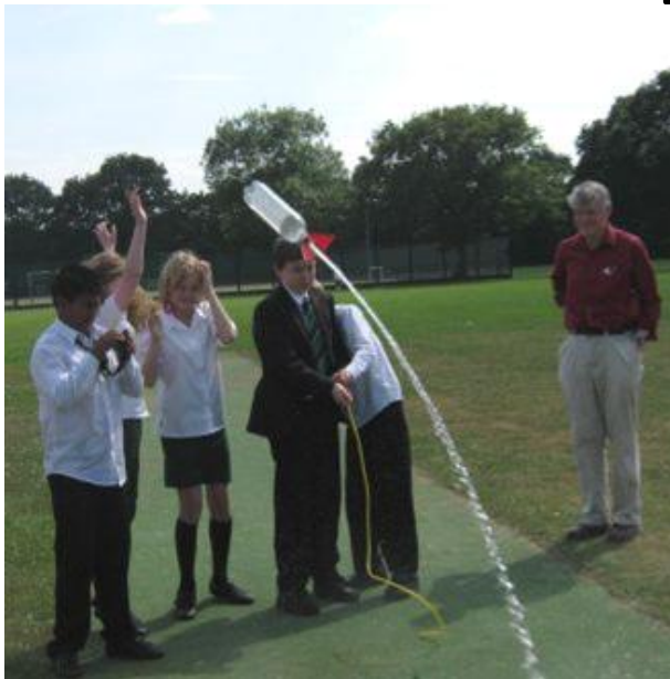
launch a bottle rocket

Mondays after school 3.00 - 4.00 p.m. in room B1