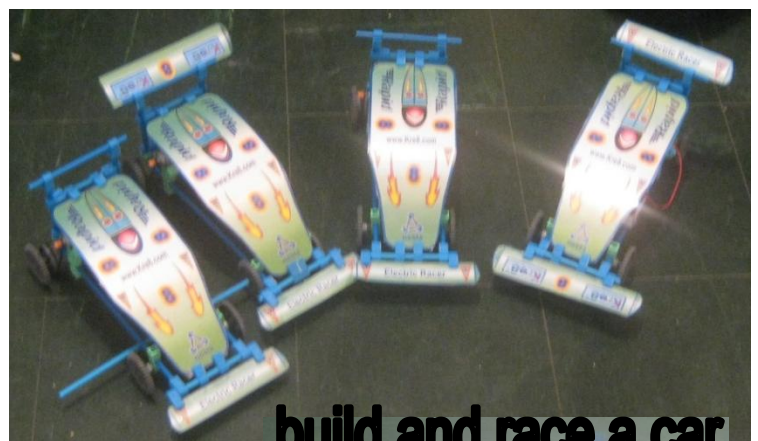
build and race a car